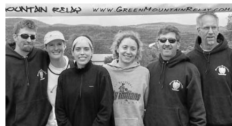
ONE OF THE TWO WANDERERS TEAMS THAT COMPETED IN THE FIRST ANNUAL GREEN MOUNTAIN RELAY IN VERMONT.